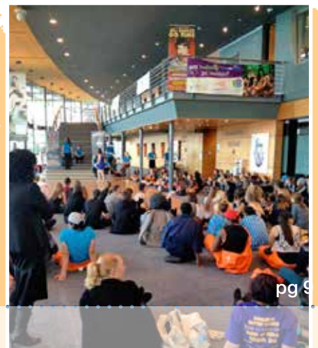
Top: Presentation of Merit Certificates at day two of Mandurah heats Right: Talent Quest